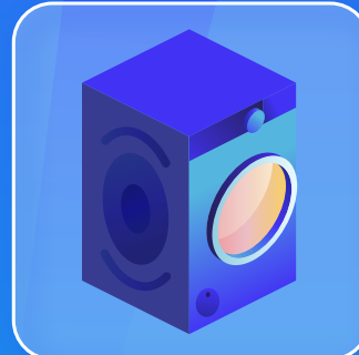
IMMERSIVE GIANT INSTALLATIONS