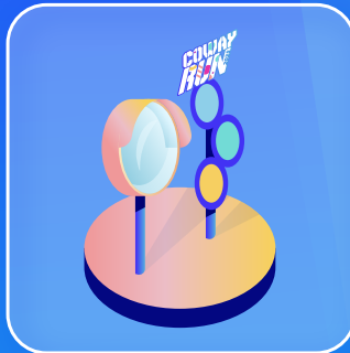
FUN PHOTO BOOTHS