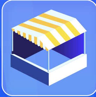
EXCITING GIFT REDEMPTION